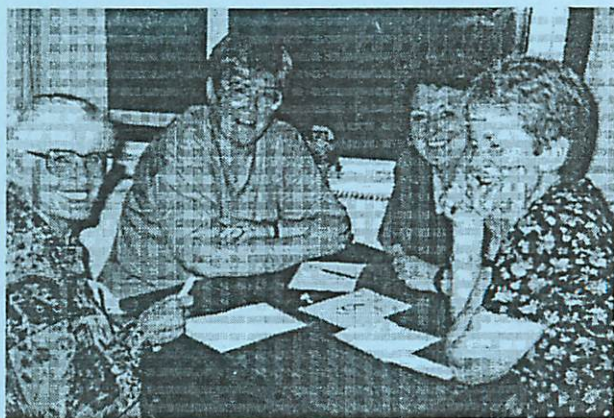
Smiles all round at the 'Ward 6 Centenary Quiz