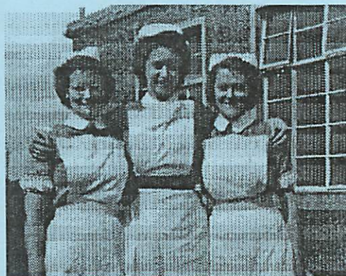
Three of Stonehouse Hospital's nurses from years gone by. Do you recognise them? You will find the answer on Page 4.

We hope nurses past and present will join with us in marking the Hospital's Centenary in this manner and we look forward to seeing you there.