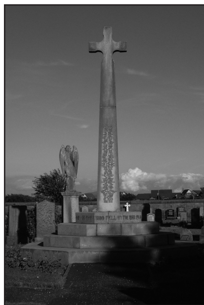
War Memorial erected in 1921 in cemetery