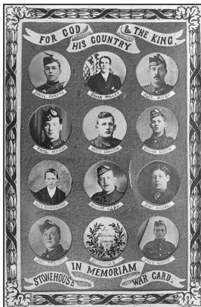
Postcard commemorating those killed in conflict

On November 8th a memorial service took place to honour and recognise men from Stonehouse who were not previously recognised on the memorial. This project was initiated by the Heritage Group who researched and sought funding address this matter. In recognition of the event South Lanarkshire Council held a Civic reception with a dedication service at the cemetery attended by local organisations and military dignitaries.