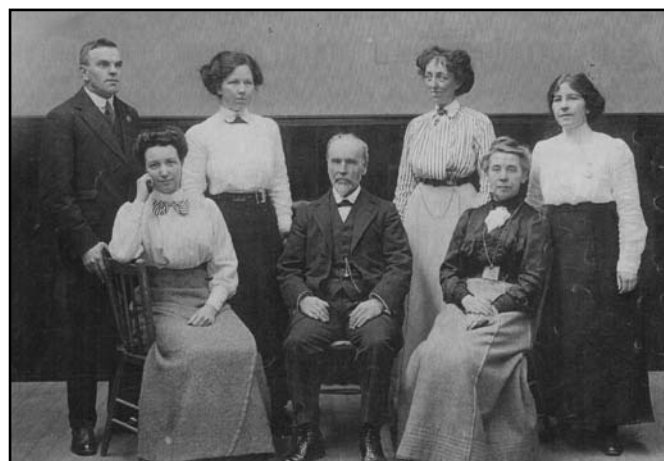
Townhead School Teachers 1914

Many of the games were played on the roadway, but it must not be thought that the roads were as smooth as they are today. They were made with a mixture of earth and stones, and everywhere there were large potholes. In wet weather, these filled up with rain and became sheets of water, which made walking very difficult. Some