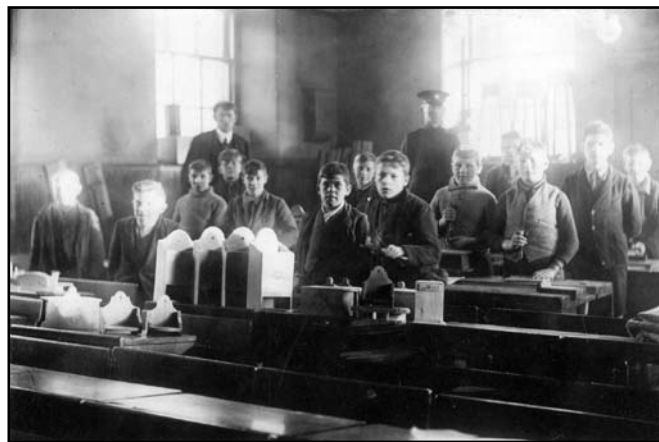
Greenside School wood work class

In those days Stonehouse children were much poorer than those of today. Often families were large, and the boys seldom had more than one suit, and this was worn until it was really tattered. The girls wore long dresses, usually made of cotton, woollen stockings and, like the boys, they wore boots.