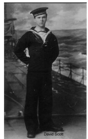
Enlisted 24/5/1915 Joined at the age of 14 years old. Served as a Gun- ner in ww2 in Army.

Over the course of the next year we intend to include a small piece on some of the personnel named on the war memorial. Here are some pictures of enlistees, casualties and personnel that we need to identify.