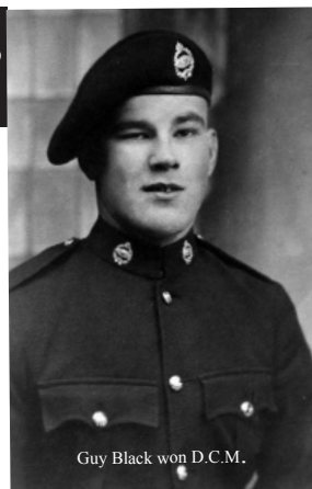
Rank Corpl Royal tank reg/Rac 7Th Kia 3.1.41 age 25in Eygpt