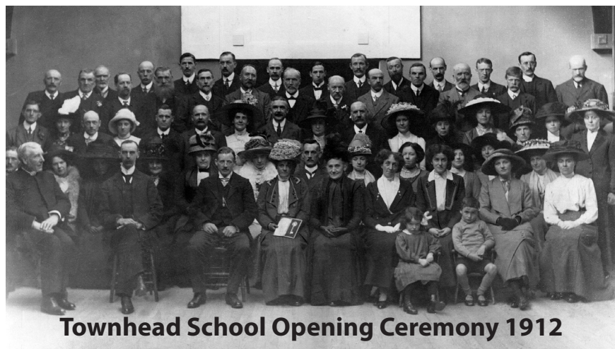
Townhead School Opening Ceremony 1912

The Free Church School in Hill Road (1851 – 1881) was leased to the Stonehouse School Board for one year in 1881, under the name of Hill Academy, while Townhead Street School was under construction. On 9th January 1882 Townhead Public School was opened by the School Board.